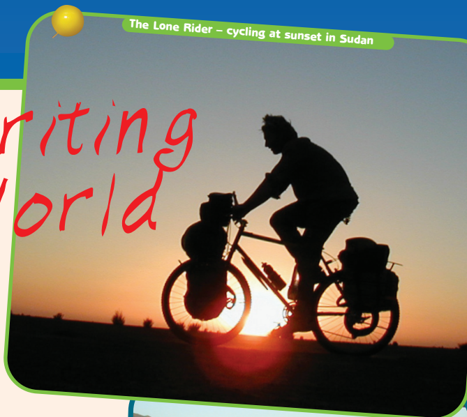
The Lone Rider - cycling at sunset in Sudan

"It is a greedy, ungrateful risk to give up all that makes you happy in the hope that you can find better. You risk not finding it. You risk finding it and then never being satisfied again, yearning always for more. But uncertain travel held an appeal for me..."