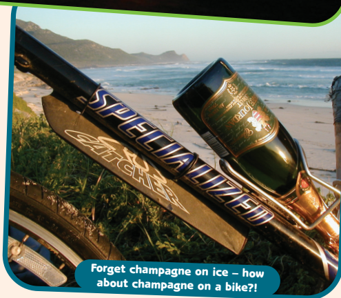
Forget champagne on ice - how about champagne on a bike?!