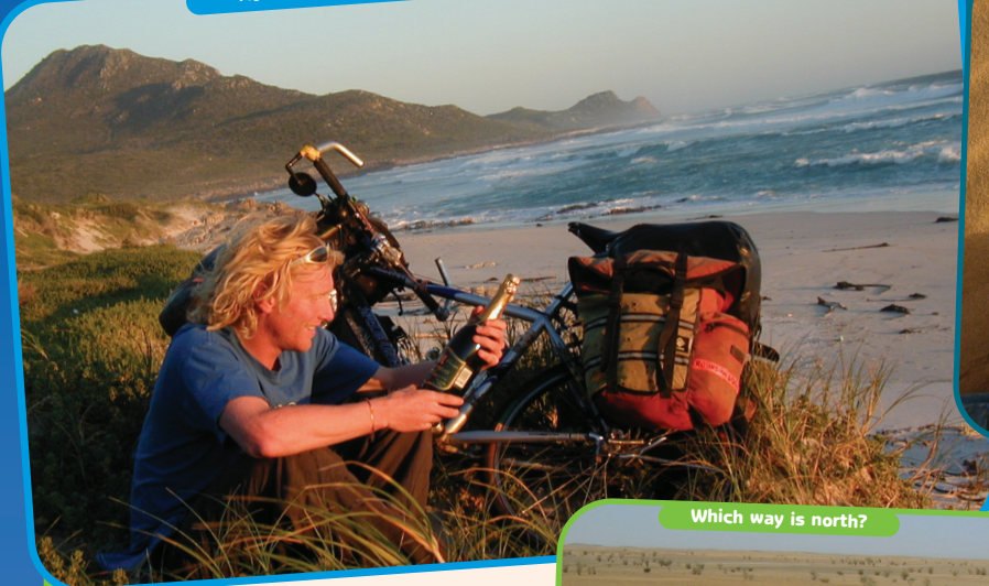
At the Cape of Good Hope, South Africa