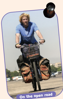
On the open road

It is a greedy, ungrateful risk to give up all that makes you happy in the hope that you can find better. You risk not finding it. You risk finding it and then never being satisfied again, yearning always for