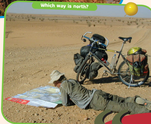
Which way is north?

worth backing. One company responded to me with disbelief, "Do you think we just got off the banana boat?! What a ridiculous idea. Go get a job if you want a bike." But I was determined: I wanted something so hard that I would surely fail unless I poured every drop of my being into it. My head alternated between being up in the clouds and up my own backside.